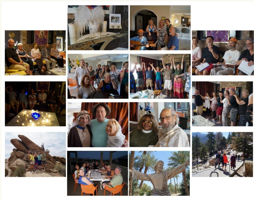
Entrance decorations; Enjoying music and getting ready for prayer; Practicing EFT tapping; Expressing appreciation for presentations; Candlelight Healing Service; Backrubs between activities; Jesus’ parables skits; Outings to Joshua Tree National Park, Palm Springs Tramway, and Shields Date Garden; After-sunset table fellowship.

Two smiling pastors came to wrap the artwork in bubble wrap for my trip. As one of them was carrying the package out to my car, and as we approached the door to exit the gift shop, I heard the nun say from behind me: “You know, that artwork is blessed.” I said: “Oh, yes! I know! I felt it immediately when I set eyes on it! It was blessed by God!” “Oh, no,” she said. “It was blessed by the priest . Everything in this shop has been blessed by the priest.” “Oh, thank you! Yes, thank you so much!” I said, knowing fully that the most powerful blessing in that beautiful rendition of Jesus came not from the priest, nor St. Francis, nor Jesus, but it came directly from God!